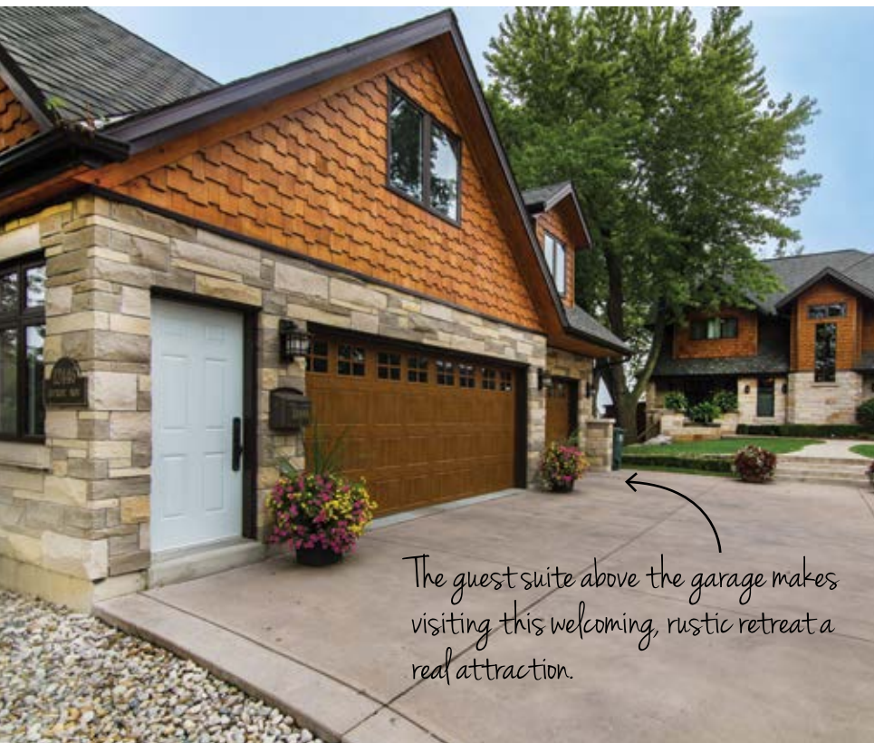
The guest suite above the garage makes visiting this welcoming, rustic retreat a real attraction.