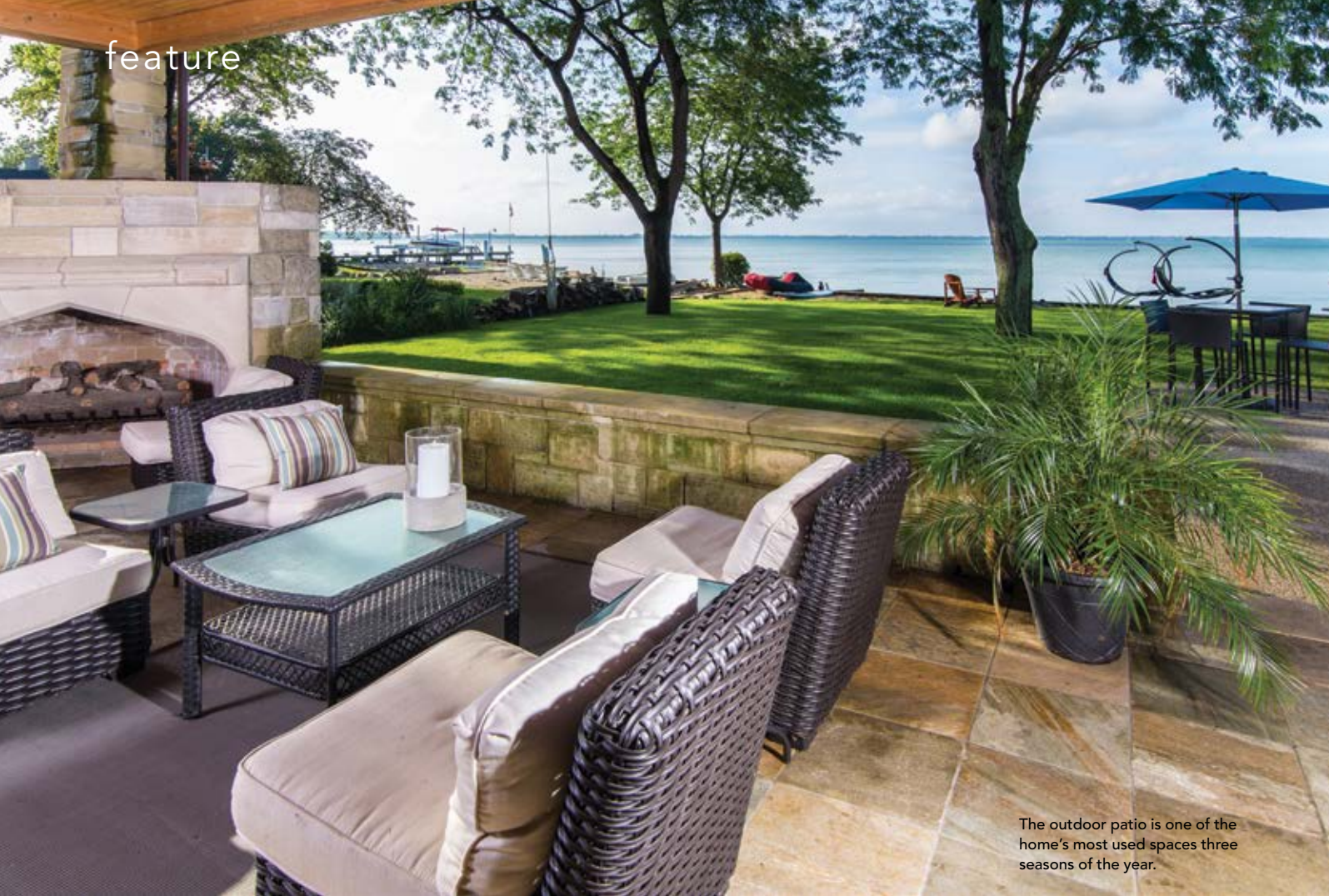
The outdoor patio is one of the home's most used spaces three seasons of the year.