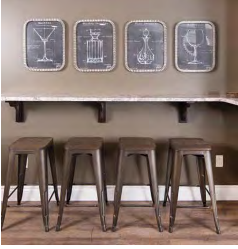
TOP: The basement has a prep kitchen and bar area. It is the scene of many family gatherings. ABOVE: The seating area is perfect for adults and children. LEFT: Artistically arranged accessories transform a bare wall.

of the clans seems a fitting way to conclude. The children have put away the hose. Their parents bundle them up in warm towels. Night is closing in. The home embraces its charges. Cosiness envelops all. oh