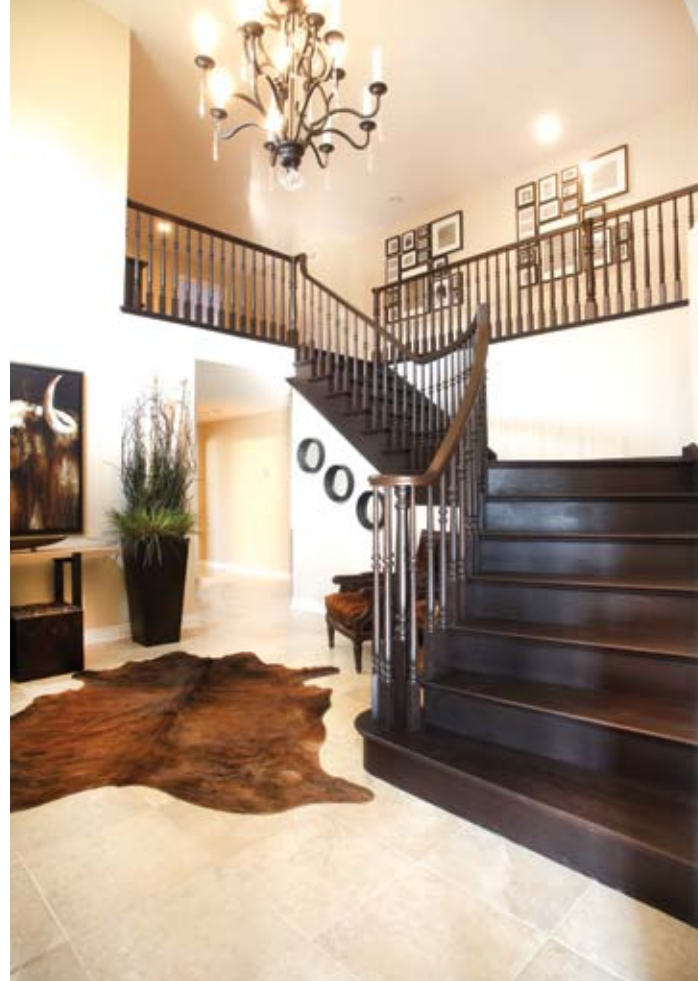
ABOVE: With its cowhide accents and western art, the front foyer provides a dramatic entrance to the home. The chandelier is from the Lighting Boutique and Appliance Shoppe. TOP LEFT: The bedroom is a private oasis. BOTTOM LEFT: Soaking in the tub is extra-special when snow is falling.

The front foyer, with its animal art and cowhide throw rugs, conveys a western sensibility. It leads to the main floor master bedroom and en suite bathroom. The en suite is situated with a fantastic water view. "There's nothing better than soaking in the tub and watching the snow come down," says the homeowner. "It's like a private oasis."