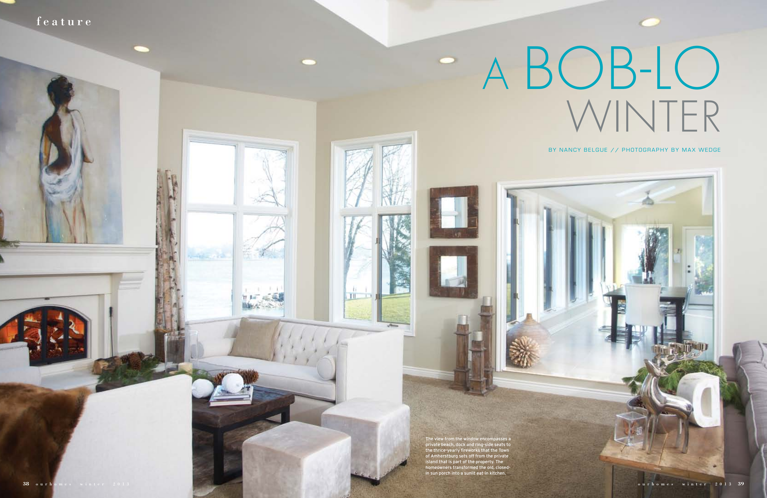
The view from the window encompasses a private beach, dock and ring-side seats to the thrice-yearly fireworks that the Town of Amherstburg sets off from the private island that is part of the property. The homeowners transformed the old, closed-in sun porch into a sunlit eat-in kitchen.

BY NANCY BELGUE