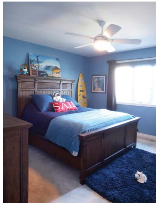
ABOVE AND RIGHT: Two charming children's bedrooms. TOP RIGHT: There is no wasted space. The upstairs hallway is used as a home office.

Nowhere is the homeowner's personal style more evident than in the living room where reclaimed barn board dominates an entire wall. "I wanted a home that had an earthy feel on the water," laughs the homeowner. She found the 125-year-old barn board in Kingsville. "It gives the wall the perfect touch of nature," she says.